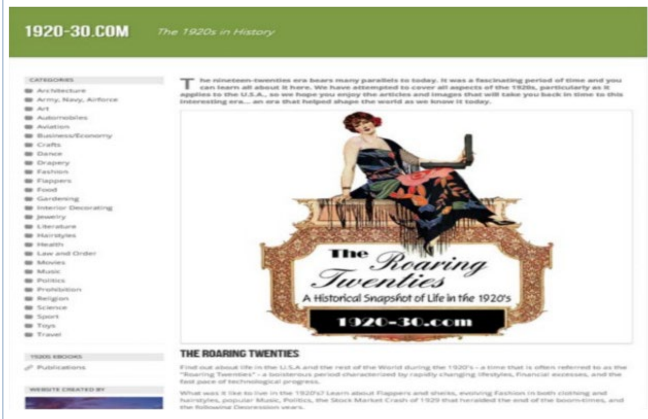
Note. This figure is the home page of the website that students were asked to visit in order to complete the WebQuest.